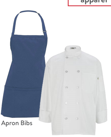
Executive Chef Coat

"I'm excited to boost employee morale with rewards and was able to award each of my 'employee of the month' winners an item. Thank you for assisting with this, Real Rewards Cafe!"